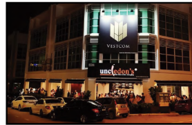
Uncle Don's (Sri Petaling) 21_G, Jalan Radin Bagus 5, Bandar Baru Sri Petaling, 57000 Kuala Lumpur