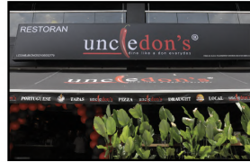
Uncle Don's (Mount Austin, Johor Bahru) 97, Jalan Mutiara Emas 10/19, Taman Mount Austin, 81100 Johor Bahru, Johor