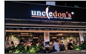
Uncle Don's (Cheras Traders Square) No 55-G and 56-G, Jalan Dataran Cheras 3, Dataran Perniagaan Cheras, 43200 Balakong, Selangor