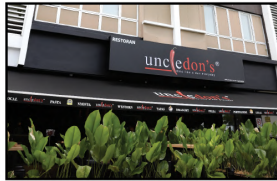
Uncle Don's (Taman Sutera Utama, Johor Bahru) 72 & 74, Jalan Sutera Tanjung 8/3, Taman Sutera Utama, 81300 Johor Bahru, Johor