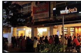
Uncle Don's (IOI Boulevard Puchong) 19, Jalan Kenari 6, Bandar Puchong Jaya, 47100 Puchong, Selangor