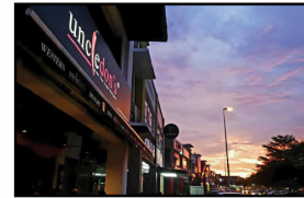
Uncle Don's (Seremban) 246, Jalan S2 B12, Seremban 2, 70300 Seremban, Negeri Sembilan