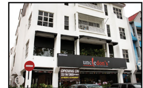
Uncle Don's (Seberang Jaya) 30, Jalan Todak 4, Pusat Bandar Seberang Jaya, 13700 Seberang Perai, Pulau Pinang