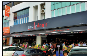
Uncle Don's (Kajang) 5-G & 6-G, Plaza Indah, Jalan Sepakat Indah 1, Taman Sepakat Indah, 43000 Kajang, Selangor