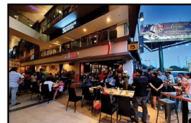
Uncle Don's (Setia Alam) B11, Sunsuria Forum @ 7th Avenue, 1 Jalan Setia Dagang AL U13/AL, Setia Alam, Seksyen U13, 40170 Shah Alam, Selangor