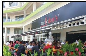
Uncle Don's (Rawang) 17-1 & 18-1, Jalan Anggun City 1, Pusat Komersial Anggun City, Taman Anggun, 48000 Rawang, Selangor