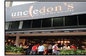
Uncle Don's (Taipan) 55A, Jalan USJ 10/1F, Taipan Business Centre, 47620 Subang Jaya, Selangor