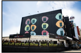
Uncle Don's (Taman Pelangi, Johor Bahru) 52, Jalan Jaya, Taman Maju Jaya, 80400 Johor Bahru, Johor