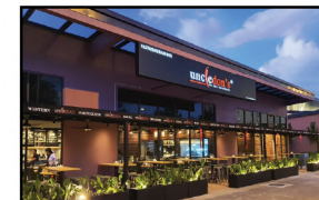
Uncle Don's (Setapak) Shop 14, The Palette Hab Komersial Danau Kota, No 8, Jalan Langkawi, Taman Danau Kota Setapak, 53000 Kuala Lumpur