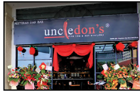
Uncle Don's (Times Square Penang) 77-G-13/14/15/16, Times Square Penang, Birch The Plaza Commercial, Jalan Dato Keramat, 10150 George Town, Pulau Pinang