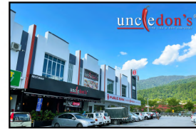
Uncle Don's (Kampar) 75 & 75A, Jalan Terminal Kampar 1/D, Pusat Perdagangan Kampar, 31900 Kampar, Perak