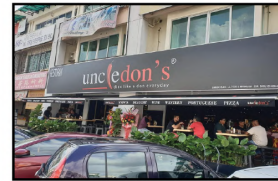
Uncle Don's (Klang) 8 & 10, Lorong Batu Nilam 3A, Bandar Bukit Tinggi 1, 41200 Klang, Selangor