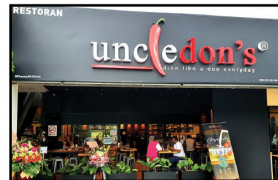
Uncle Don's (Cyberjaya) Unit G-2A, Block 3545, Prima 11, Jalan Teknokrat 6, Cyberjaya, 63000 Sepang, Selangor