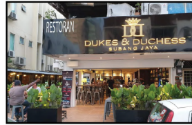
Dukes & Duchess (SS15 Subang) 64, Jalan SS 15/4C, 47500 Subang Jaya, Selangor