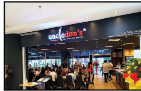
Uncle Don's (Quill City Mall) G-03, 03A & 05, Ground Floor, Quill City Mall, 1018 Jalan Sultan Ismail, 50250 Kuala Lumpur