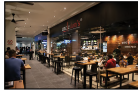
Uncle Don's (Sentul Point) Unit AG-28 & AG-29, Ground Floor, Puncak Sentul (Sentul Point), No.8, Jalan Sentul Perdana, Sentul, 51000 Kuala Lumpur