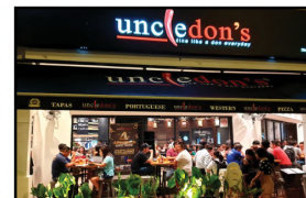
Uncle Don's (Fortune Avenue, Kepong) C-G-20, Jalan Metro Perdana 3, Taman Usahawan Kepong, 52100 Kepong, Kuala Lumpur