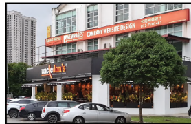
Uncle Don's (Equine Park) 21-G, Jalan Equine 1C, Taman Equine, Sri Kembangan, 43300 Sri Kembangan, Selangor