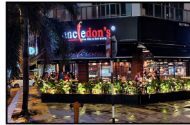
Uncle Don's (Kulai, Johor) 229 & 229-A Jalan Kenanga 29/2, Indahpura, 81000 Kulai, Johor