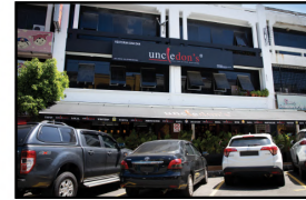
Uncle Don's (Menjalara) 59 & 61, Jalan 11/62A, Bandar Menjalara, 52200 Kuala Lumpur