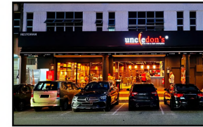
Uncle Don's (Batu Pahat) 33, 33A, 35, 35A, 37 & 37A, Jalan Flora Utama 8, Taman Flora Utama, 83000 Johor