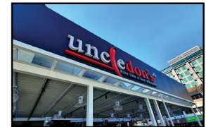
Uncle Don's (Malacca) No. 1, Kompleks Melaka Raya, Jalan Merdeka, Taman Melaka Raya, 75000 Melaka