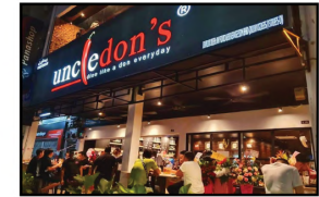
Uncle Don's (Kuantan) A1, Jalan Air Putih, Taman Berserah, 25300 Kuantan, Pahang