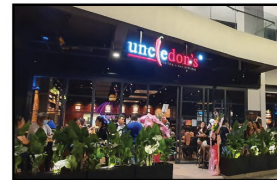
Uncle Don's (Quayside, Kota Kemuning) GF(W)-08 & GF(W)-09 Kompleks Perniagaan Gamuda Quayside, 42500 Telok Panglima Garang, Selangor