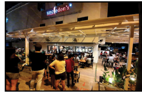
Uncle Don's (Ipoh) 41, Jalan Dato Seri Ahmad Said, 30450 Ipoh, Perak