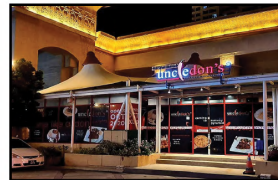
Uncle Don's (Sunway Pyramid) Lot K5 - K6A, Oasis Boulevard, Sunway Pyramid Shopping Centre, 3 Jalan PJS 11/15, Bandar Sunway, 47500 Subang Jaya, Selangor