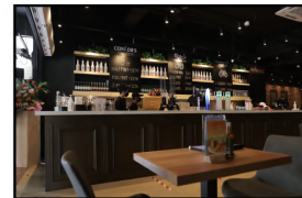
Uncle Don's (Sitiawan) 68,69,70,71 Jalan Raja Muda Musa 2/1, Taman Raja Muda Musa 2, 32000 Sitiawan, Perak