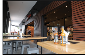
Uncle Don's (Semenyih) Lot No. H-01-01, Block H, Ecohill Walk, 43500 Semenyih, Selangor