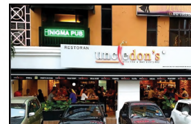
Uncle Don's (Taman Desa) 21 & 23, Plaza Danau Desa 2, Jalan 3/109 F, Taman Danau Desa, 58100 Kuala Lumpur