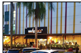
Uncle Don's (Cheras Leisure Mall) LOT G23 - G28, Ground Floor, Cheras Leisure Mall, Jalan Manis 6, Taman Sagar, Cheras, 56100 Kuala Lumpur