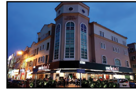
Uncle Don's (Kota Damansara) No 1-1, Jalan PJU 5/6, PJU 5 Dataran Sunway, 47810 Kota Damansara, Petaling Jaya, Selangor