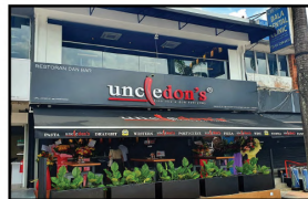
Uncle Don's (Bangsar) 18, Jalan Telawi 5, Bangsar, 59100 Kuala Lumpur