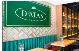
D'Atas Restaurant 108G, SS21/39, Damansara Utama, 47400 Petaling Jaya, Selangor