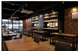
Uncle Don's (Scott Garden) The Scott Garden Unit G9 & G10, 289, Jalan Klang Lama, 58200, Kuala Lumpur