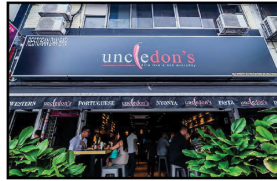
Uncle Don's (SS2, Petaling Jaya) 183 & 181-1, Jalan SS 2/24, 47300 Petaling Jaya, Selangor