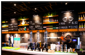
Uncle Don's (Kluang) No.30, Jalan Duku, Kampung Masjid Lama 86000, Kluang, Johor