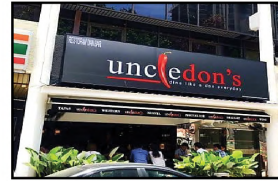
Uncle Don's (TTDI) 17, Jalan Wan Kadir 2, Taman Tun Dr Ismail, 60000 Kuala Lumpur