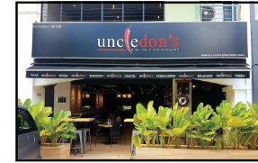
Uncle Don's (Hartamas) 10, Jalan 22A/70A, Desa Sri Hartamas, 50480 Kuala Lumpur