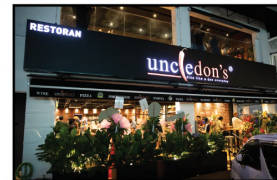
Uncle Don's (Taiping) 229, Lorong Tupai, 34000 Taiping, Perak