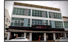
Uncle Don's (Teluk Intan) 38, 38A & 38B, Lorong Impiana 1, Taman Impiana, 36000 Teluk Intan, Perak